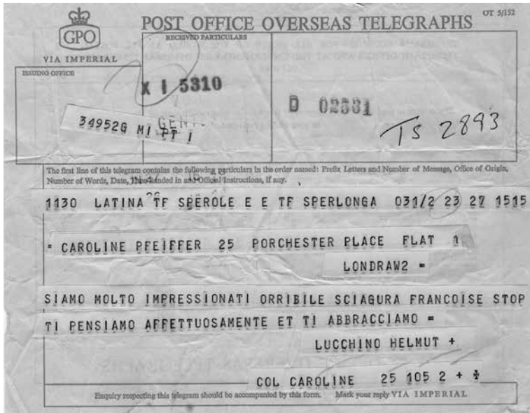
Death of Françoise Dorléac telegram from Luchino Visconti and Helmut Berger