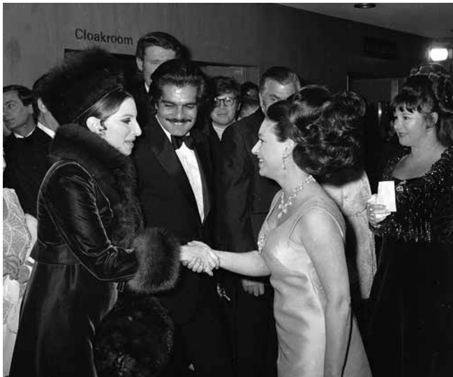
Barbra, Omar, and Princess Margaret at the Funny Girl premiere