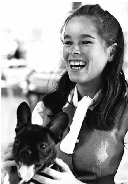
Geraldine Chaplin with Boris, her French Bulldog