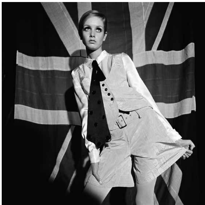
Twiggy, wearing an ensemble by Mary Quant, June 1966