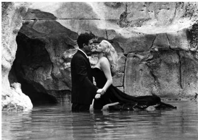
Marcello Mastroianni and Anita Ekberg in La Dolce Vita