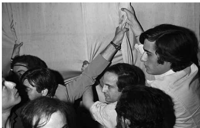
François Truffaut and other directors shut down the 1968 Cannes Film Festival