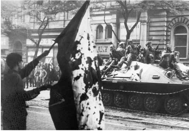
The Soviet invasion of Czechoslovakia