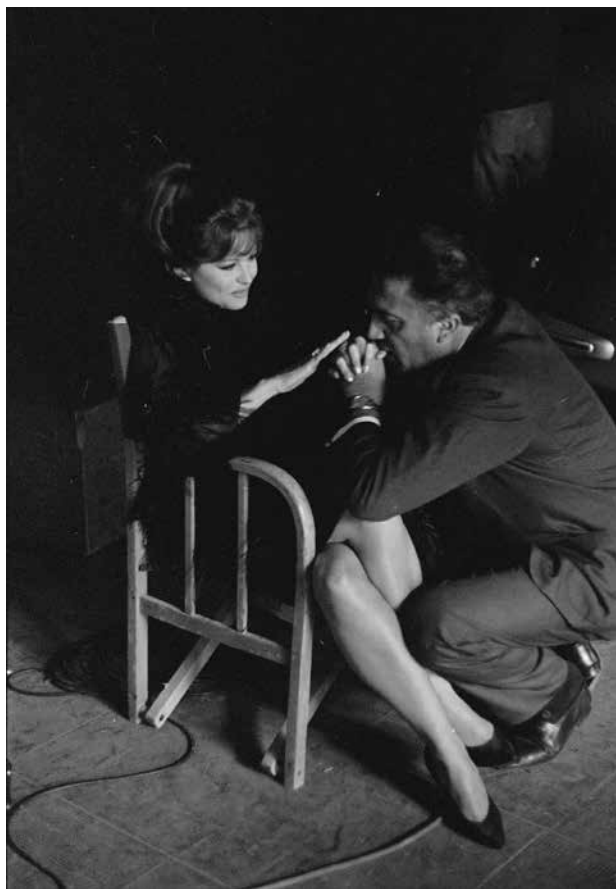
Claudia and Fellini on the set of 8½