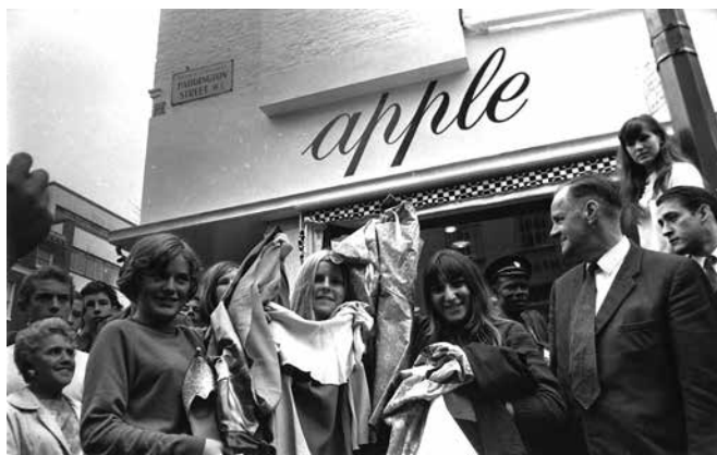
Closing day at the Apple Boutique