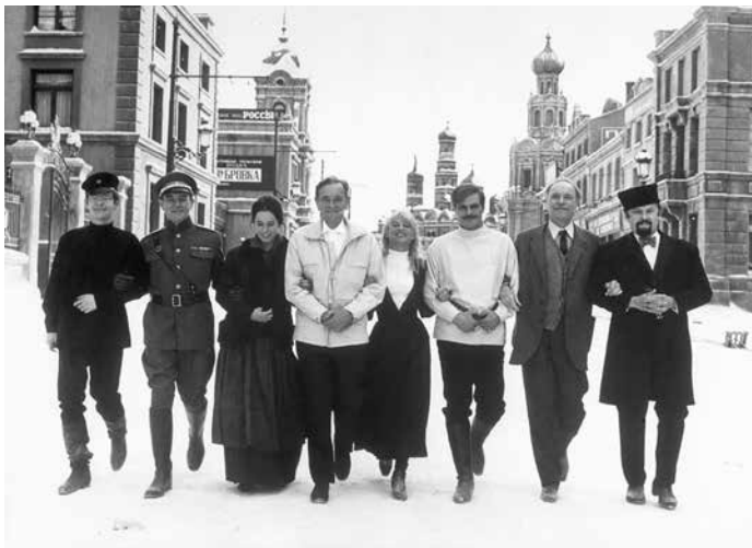
Director David Lean and cast on the set of Doctor Zhivago