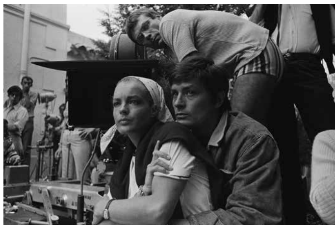
Romy and Alain on the set of La Piscine