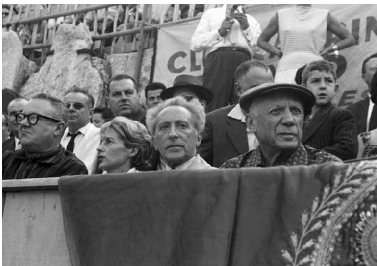
Jean Cocteau and Pablo Picasso at a bullfight in Arles, France