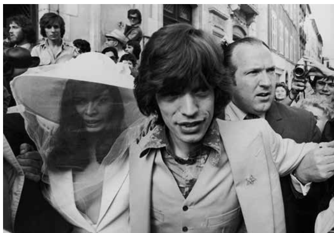
The wedding of Bianca and Mick Jagger