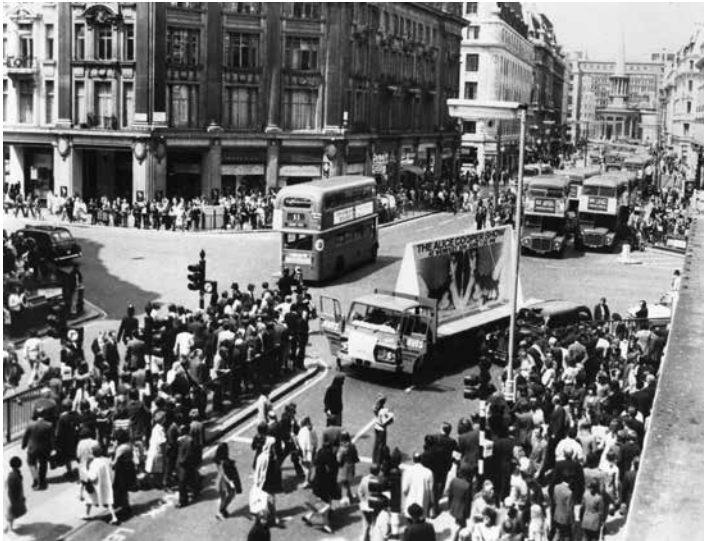
Alice Cooper billboard breakdown in Oxford Circus