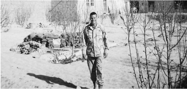
A U.S. military firebase somewhere in Afghanistan during the Global War on Terrorism.