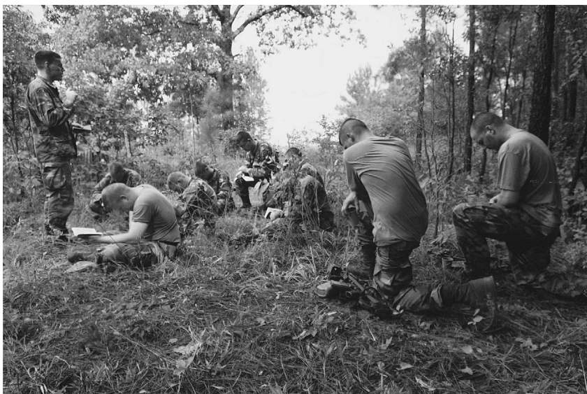
A field worship service in Louisiana with paratroopers from the 82nd Airborne Division.