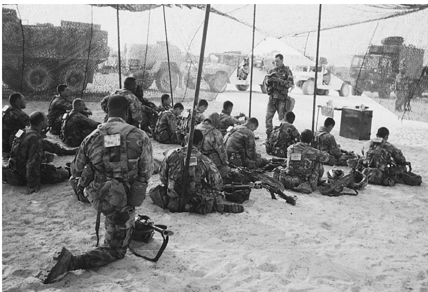
A chapel service in the deserts of Fort Irwin, California.