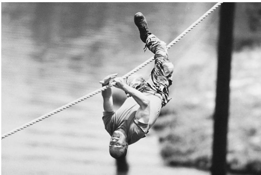
The "Log-walk, Rope-drop" event over Victory Pond in the Best Ranger Competition, Fort Benning, Georgia.