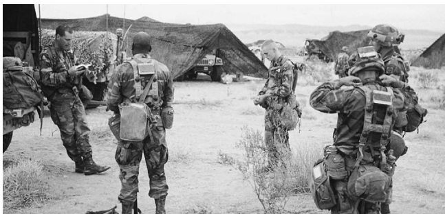
Soldiers take a break to listen to the Word of God at Fort Irwin, California.