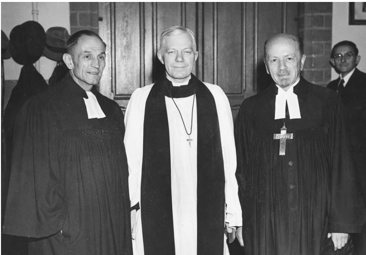
Martin Niemöller (left) and Rev. Otto Dibelius (right) flank the Bishop of Chichester, George Bell.