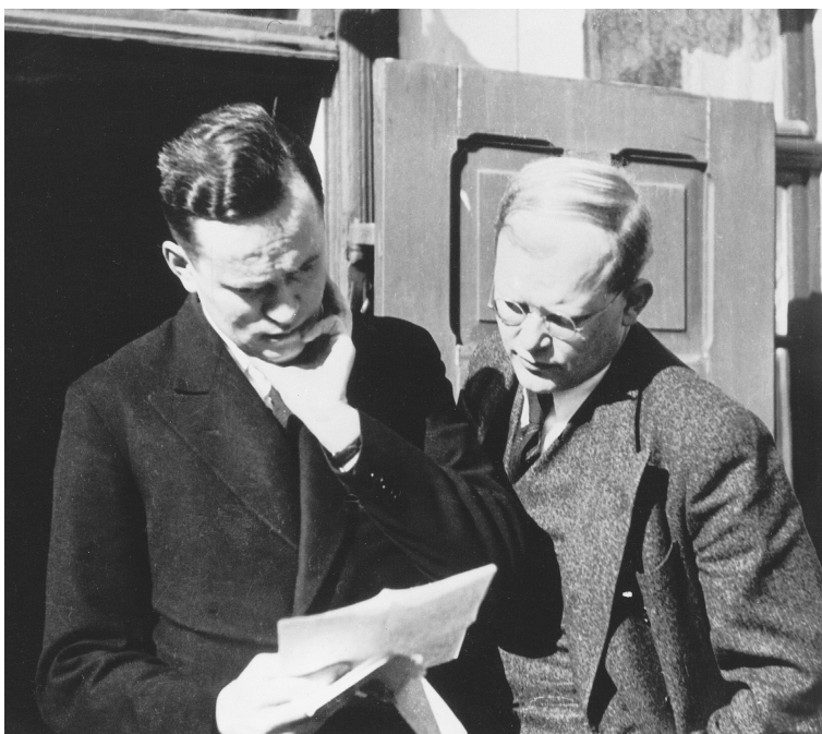
Bonhoeffer (right) and Eberhard Bethge during the summer of 1938, in the parish house at Gross-Schlönwitz.